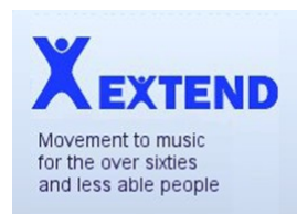
Participants enjoying an EXTEND class

Today's sedentary lifestyles can lead to a risk of developing illnesses such as type 2 diabetes, heart disease and cancer. Experts agree that exercise has a powerful effect on both the treatment and prevention of chronic disease and obesity with the added benefit of reducing the risk of falls, lifting the mood and creating a feeling of wellbeing.