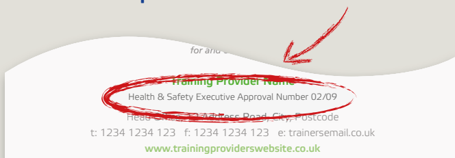
Sample HSE Certificate